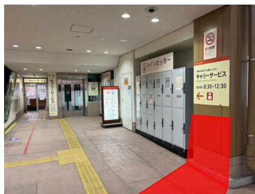
Image of dedicated online booking counter location