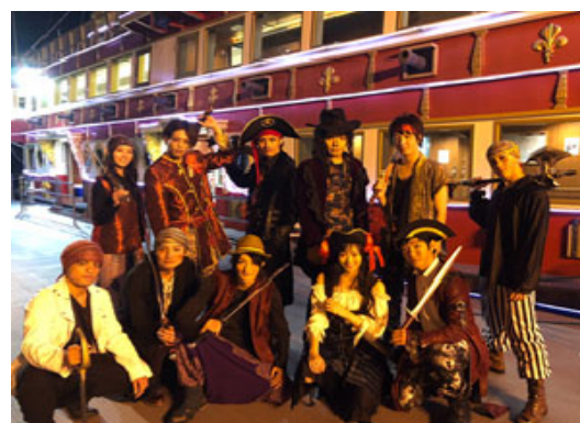
Lake Ashi, Hakone—Pirates of Sunset Cruise