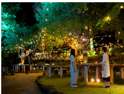
Hakone-Yumoto—Summer Night Village 29 Bar & Grill

Working together with the local community and other business enterprises, the Odakyu Hakone Group is working to create additional appeal for Hakone through the holding of different types of special events and through the dissemination of relevant information