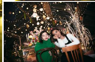
Last year's event